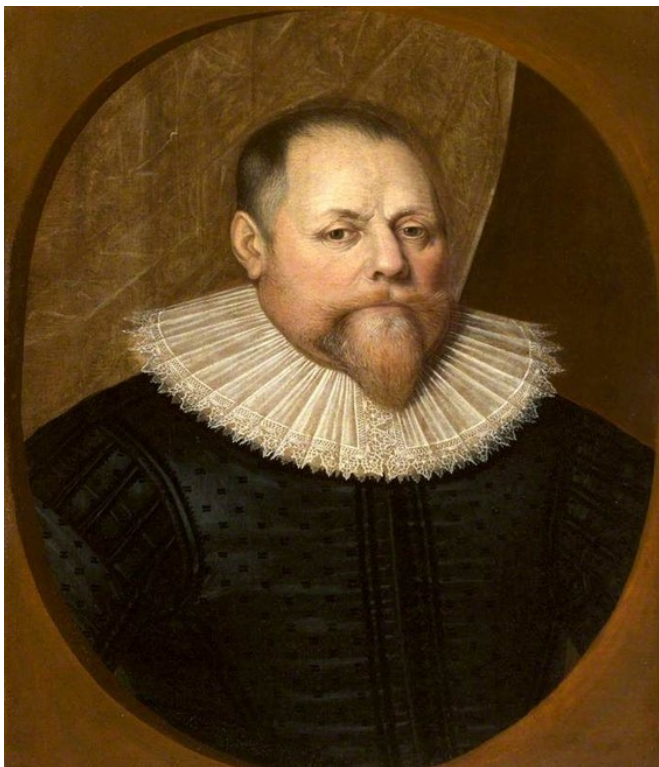
Ralph Hawtrey of Ruislip (1570–1638) – “Ralph with the ruff”

The property on the site was called Eastcote House from around the early 16th century with the building being demolished in 1964. For a good part of its life Eastcote House was owned by the Hawtrey Family including several called Ralph. One of these is pictured below.